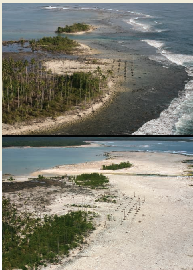
Flip-flop. Before the 2005 rupture, Nias's southwest coast was subsiding, as indicated by the stand of dead coconut palms seaward of the beach (top). The rupture lifted the coast here 2.5 meters.

the nongovernmental organization didn't anticipate the difficulty of moving it inland to homesteads in Tagaulei Two. The delays have created tensions with the villagers. "Our staff have been threatened with knives," he says. AMDA is planning a second lumber shipment for next month and aims to complete all homes by the end of January. "Now," says Usami, "we're moving very fast."