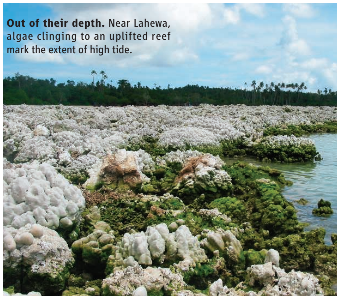
Out of their depth. Near Lahewa, algae clinging to an uplifted reef mark the extent of high tide.

CREDITS (TOP TO BOTTOM): KERRY SIEH AND ARON MELTZNER; DANINY HILMAN NATAWIDJAJA