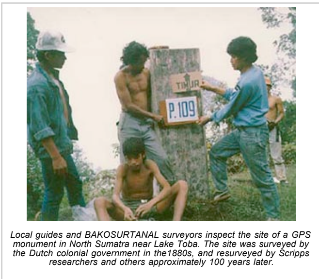
Local guides and BAKOSURTANAL surveyors inspect the site of a GPS monument in North Sumatra near Lake Toba. The site was surveyed by the Dutch colonial government in the 1880s, and resurveyed by Scripps researchers and others approximately 100 years later.

Like all massive earthquakes, the 2004 event occurred on a subduction megathrust, in this case the Sunda megathrust, an earthquake fault along which the Indian and Australian tectonic plates are diving beneath the margin of Southeast Asia. The fault surface that ruptured cannot be seen directly because it lies several kilometers deep in Earth's crust, largely beneath the sea.