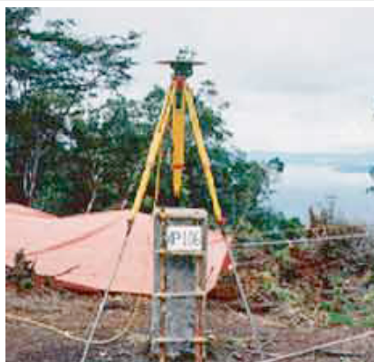
The image of an old primary triangulation pillar from the 1880s being surveyed by a GPS instrument in 1989. Monuments such as these, surveyed between 1989-2001, were resurveyed after the 2004 Sumatra-Andaman earthquake to determine coseismic displacements.